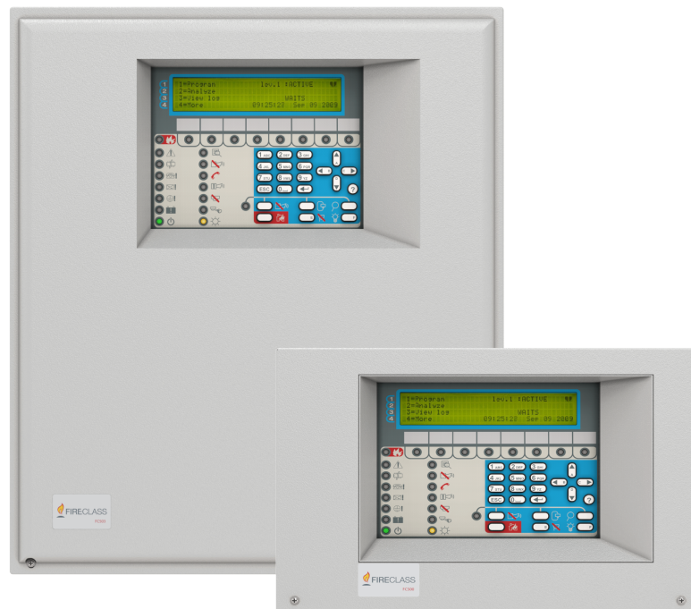
Figure 1: FC506 front panel with FC500 repeater

The FC506 auto-addressing panel has 6 in 2 loops that can support up to 500 addressable devices and 256 zones. An IP board is available as an option for this panel.