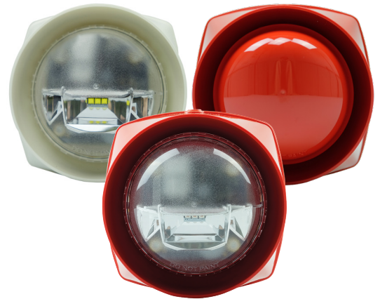
NON EP RANGE

S-Cubed offers a comprehensive range of loop powered alarm sounders with integrated voice and EN54-23 certified visual alarms. Combined with flexible configuration from the fire control panels, this loop powered device can give a differentiated combination of audible and visual alarms for alert and general evacuation.